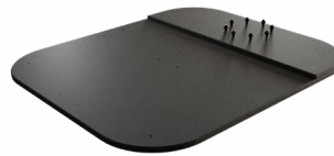
OPTIONAL BASEPLATE 400-1120