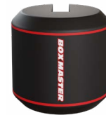
OPTIONAL KICK PAD 731-5674