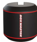
OPTIONAL KICK PAD 731-5674